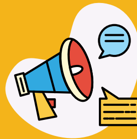
SMM (SOCIAL MEDIA MARKETING)