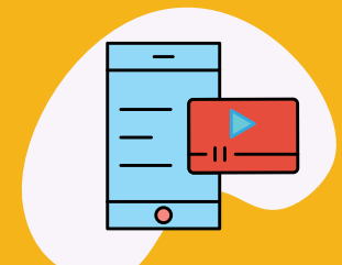
MOBILE APPLICATION DEVELOPMENT