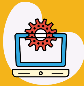
SEM (SEARCH ENGINE MARKETING)