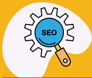
SEO (SEARCH ENGINE OPTIMIZATION)